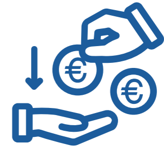
Grants and innovative vouchers