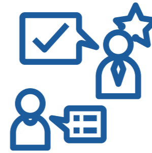
Impact measurement and reporting