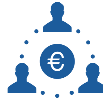
Green start-ups meet investors