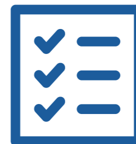
Financial and crowdfunding tools