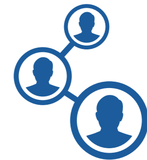
Business and networking opportunities